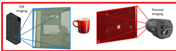
Capture of images